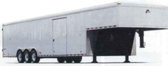
Trailers or Campers