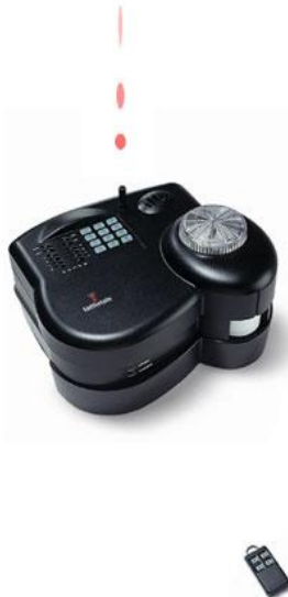
Wireless Tamper-proof Box