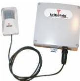
Storage Container Motion